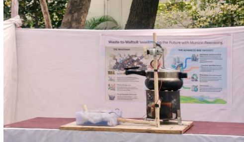
Figure 2 .Waste To Watts Model

(A Monthly, Peer Reviewed, Refereed, Scholarly Indexed, Open Access Journal)