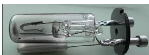
Figure 3 . Temperature Heating Sensor

The primary purpose of a heating sensor is to find out where the heat is in the system. A heat sensor's primary function is to detect the heat that is present around it. Overheating causes the temperature around the heat sensor to rise above its predetermined level, at which point it detects the heat and provides a warning with the help of a glowing LED so that we can safeguard .